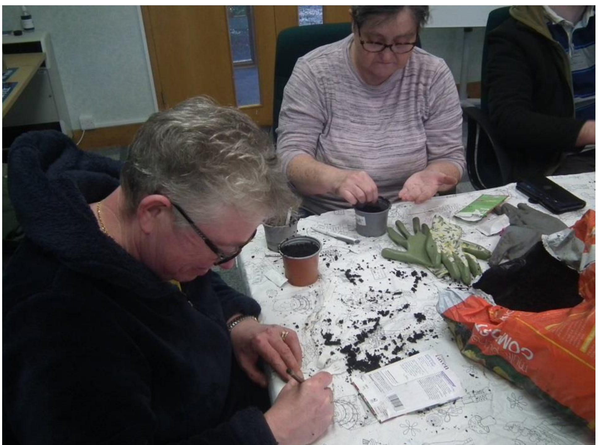
Seed planting Jan 17th