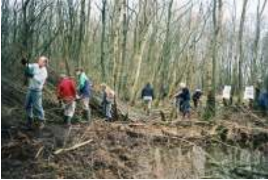
Conservation tasks: Marshes