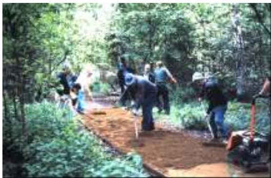
Estate management: Footpaths