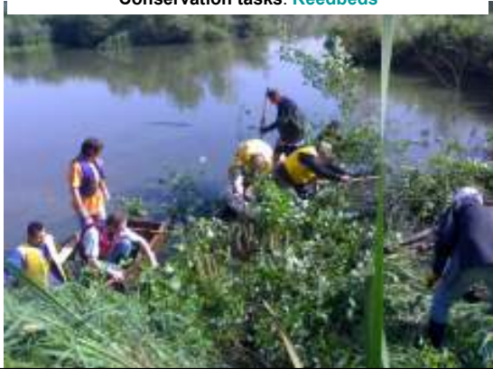
Conservation tasks: Reedbeds