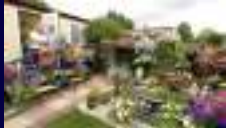
1st Place 6 The Orchard, Chilton Farm Park