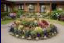
1st Place Shaftesbury Court, Farnborough