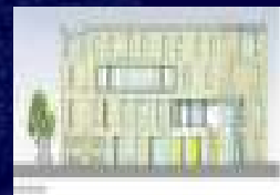
Step by Step