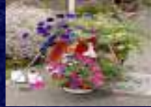
1st Place 34 Field Way, Aldershot