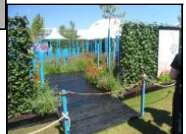
100 years of Guiding—"Best in Show"